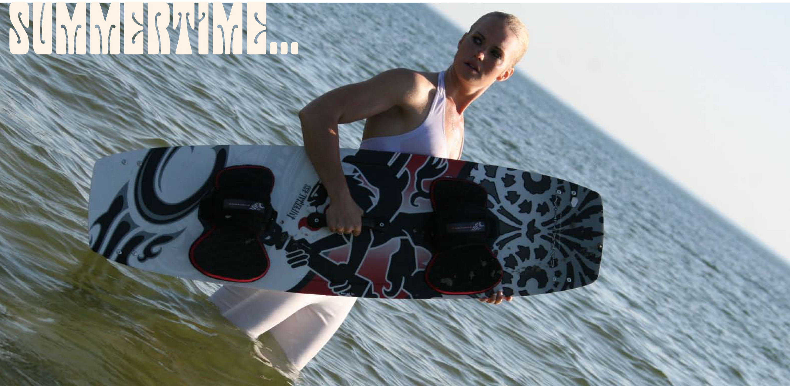
Kiteboard - Cabrinha Imperial