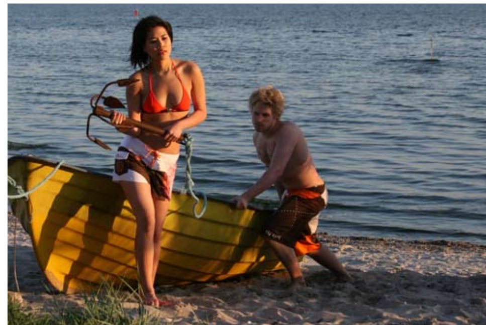
Brown Shorts - Billabong • Ladies Shorts - Oxbow • mens Shorts - Rip Curl