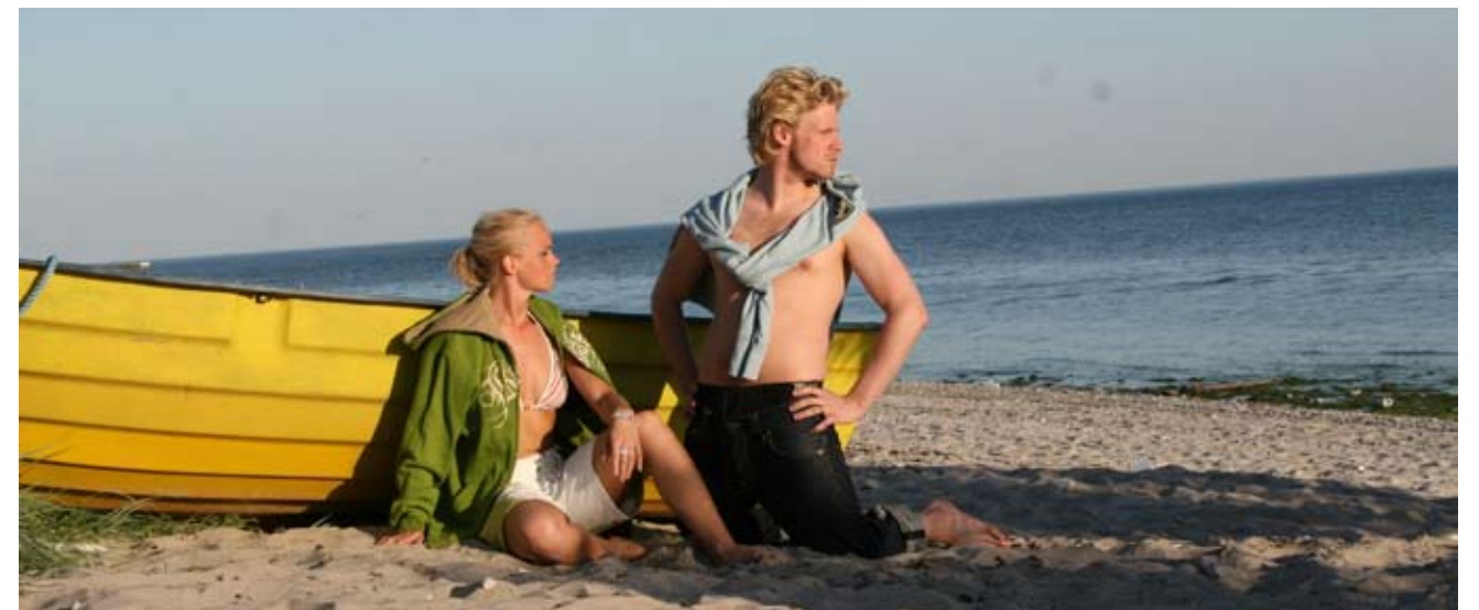
Dress - Gucci • Green Jacket - Billabong • Jewelry - Swarovski • Jeansshorts - Dsquared • Sweater - Falsterbo Horse Show