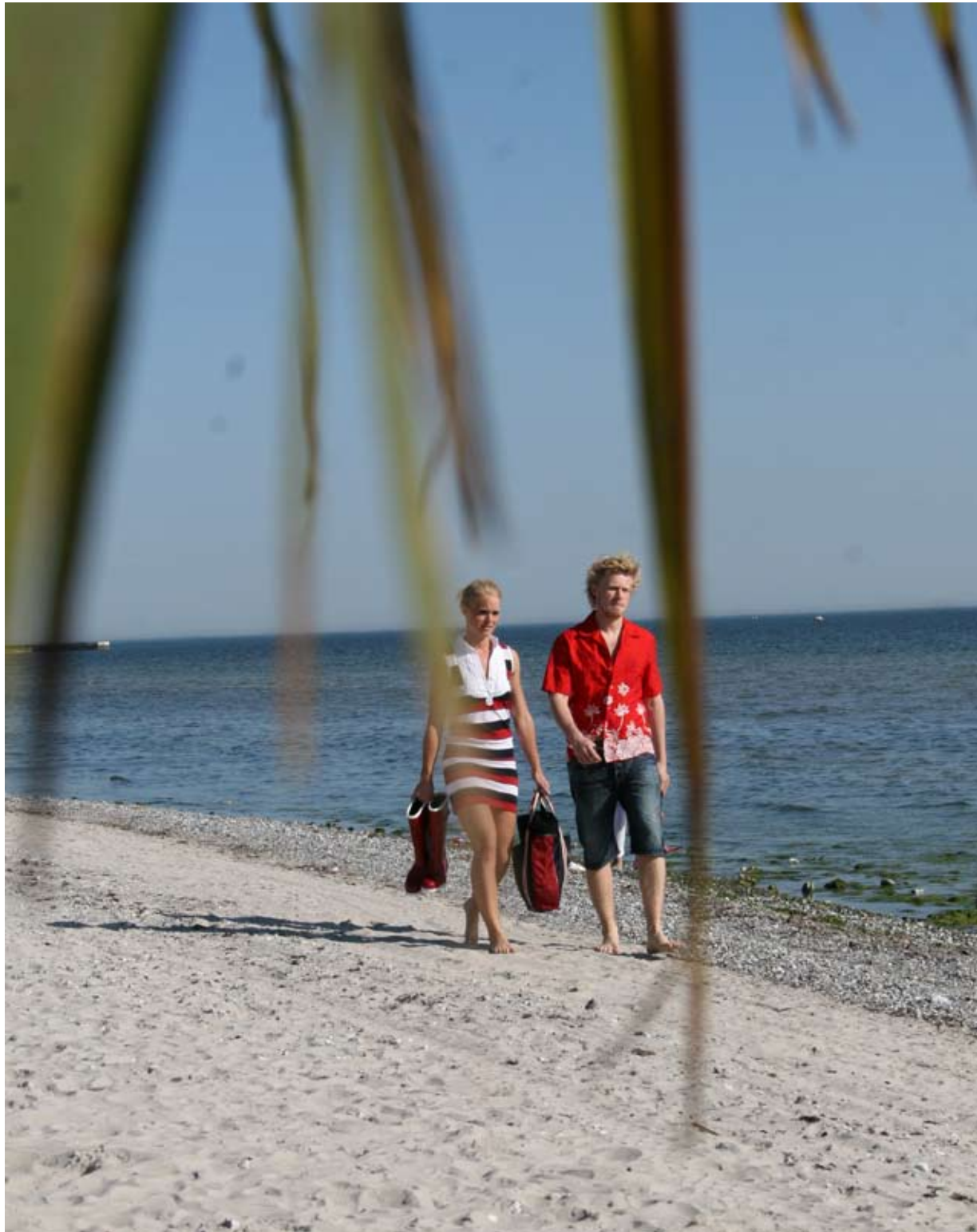
Boots - Gucci • Beachbag - Gucci • Beachdress - D&G • Shirt - Rip Curl • Jeanshorts - Dsquared