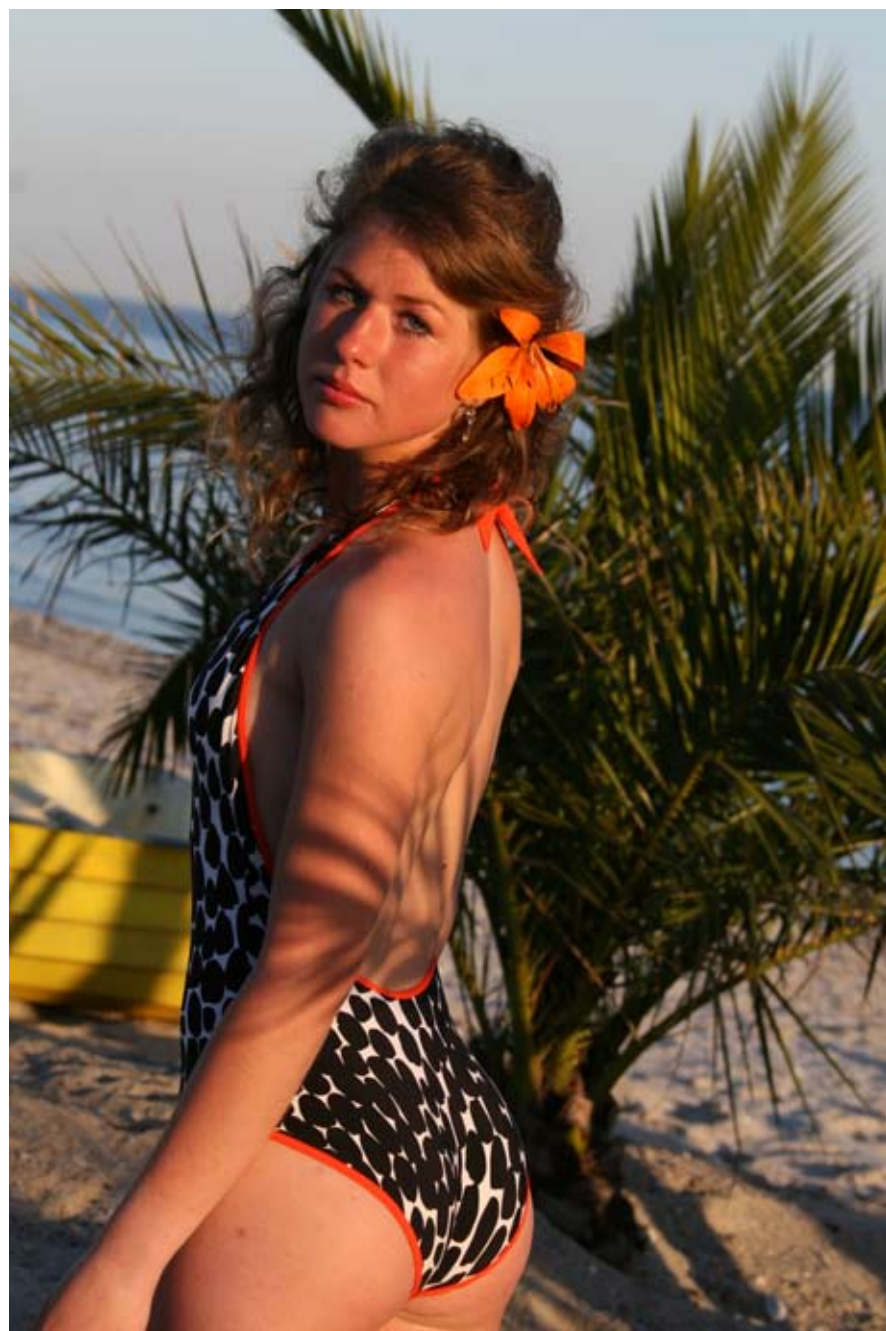
Swimsuit - Gucci • Giant Towel - Gucci